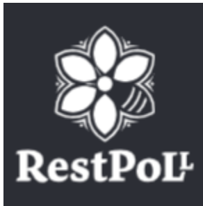
Fig. 4 RestPoll logo (Black and white with a black background version).

The RestPoll logo serves as the basis for all further promotional materials, as well as the website, in order to ensure consistent branding across all dissemination tools. All versions of the logo can be found and downloaded on the RestPoll website.