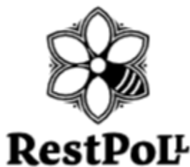
Fig. 3 RestPoll logo (Black and white version).