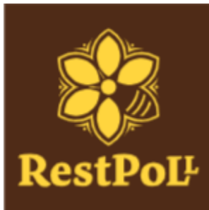
Fig. 2 RestPoll logo (diapositive version version).